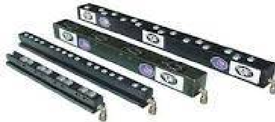
Fig.10. Die Lifter

Die lifter is of rectangular cross section & can be fitted in "T" Slot of bolster. In 250 mm & 200 mm length die lifters, four & three single acting, load return cylinders are fitted respectively. Various lengths can be assembled by using combinations of 250 & 200 length die lifters.