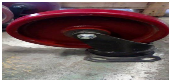
Fig.5. Rotating Arm Wheel

To rotate non-directional tires, use the cross pattern. For cars with rear-wheel drive, move the front tires to the opposite sides of the rear: left-front to right- rear and right-front to left-rear. The rear tires are moved straight forward.