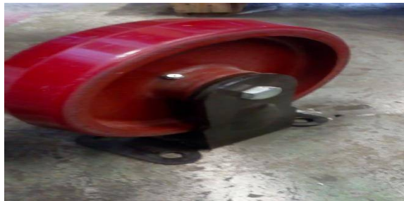
Fig.4. Non Rotating Arm Wheel

A wheel is a circular component that is intended to rotate on an axle bearing. Wheel are everywhere in our world today in very obvious places (on cars, trucks, and airplanes), but also hidden inside everything from computer hard-drives and clothes washers to electric toothbrushes and dishwashers. Six thousand years ago, there weren't any wheels at all.