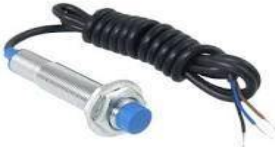
Fig.9. Proximity Sensor

A proximity sensor is a sensor able to detect the presence of nearby objects without any physical contact. Proximity sensors can have a high reliability and long functional life because of the absence of mechanical parts and lack of physical contact between sensor and the sensed object.