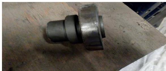
Fig.1. Bearing Setup

The most applications, one race is stationary and the other is attached to the moving assembly (e.g., die or material). As one of the bearing races moving it causes the balls to rotate as well. Because the balls are rolling they have a much lower coefficient of friction than if two flat surfaces were sliding against each other.