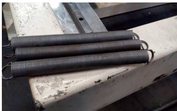
Fig.6. Extension Spring

The extension spring stretches apart to create load. They often have little loops on the ends to attach to things. You may find these on the screen door hinge, garage door hinge, and bouncy decorations that hang from the ceiling. The Slinky(tm) is a very weak extension spring. Extension springs, however are different in two ways. Firstly, they are normally close-coiled whereas in compression springs the coils are open.