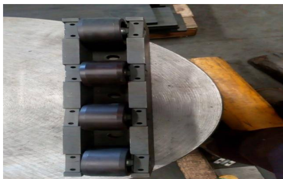
Fig.2. Front and Back Movement Setup of Bearing

The up and down movement bearing setup consist of bearing, bearing locker pin, lock plate, roller bracket and screw. The up and down movement bearing setup is shown in fig.