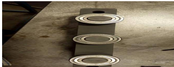
Fig.3. Left and Right Movement Setup of Bearing

The setup is used to do not allow the material for handling time for the setup. So the left and right bearing setup is used.