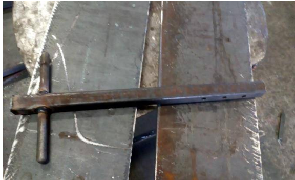
Fig.7. Pull Handle

One major category of handles are pull handles, where one or more hands grip the handle or handles, and exert force to shorten the distance between the hands and their corresponding shoulders. The three criteria stated above are universal for pull handles. Many pull handles are for lifting, mostly on objects to be carried.